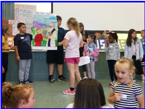
The feeding of the 5,000

The next Holiday Club – Monday 21 st October 10:00 – 12:00 in the Church Hall. All Primary School children welcome!