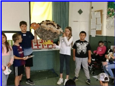
A giant quail