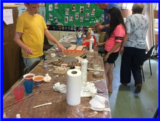
Making a Roman centurion

Our Summer Holiday Club was based around events which took place in different cities of the Bible. The children enjoyed stories, games and craft activities based around each day's theme.