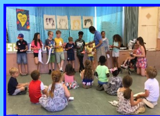
Displaying our craft activities

The next Holiday Club – Monday 22 nd October 10:00-12:00 in the Church Hall All Primary School children welcome!