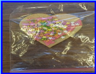
Decorating biscuits colouring, cutting and sticking was popular!