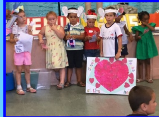
Wearing our "listening ears"