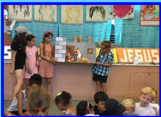
Telling the story of Paul and Silas