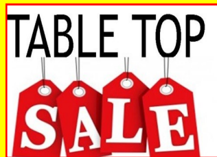
Table Top Sale